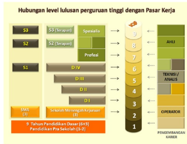
Figure 1. Level of qualification of the IQF and educational system (Endrotomo, 2012)

The European Qualification Framework (EQF) is one of the main references to develop the IQF. In the EQF there are eight levels qualification (Cedefop, 2010), whiles IQF has nine levels of qualification. Level 1 is the lowest level and level 9 is the highest level. Level 1-4 is considered as an operator level, level 5-6 is a technician/analitical level, 6-7 is a profesion level, and 8-9 is an expertise level (Perpers Republik Indonesia Nomor 8 Tahun 2012).