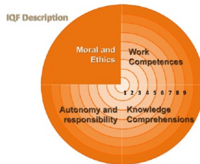
Figure 3. IQF description: (a) Moral and Ethics, (b) Work competences, (c) Knowledge comprehensions, and (d) Autonomy and responsibility (Megawati Santoso, 2013)

Every levels of IQF consists of four major competency, those are (a) knowledge, (b) skills, (c) research, and (d) managerial (Dikti, 2010:18). The four competences are considered as generic competences. Beside the four competences, every worker must also possess a certain moral and ethics.